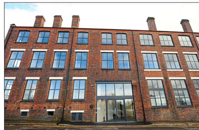
The exterior has been spruced up while retaining original features

When asked if retaining the building's heritage is important to him, Mr Wordley revealed that the Sunbeam sign will be put back on the apex of the building and added: "Of course, otherwise it's just not going to look right. It was a huge part of what we were doing, and the Sunbeam sign is going back on the apex. That will really make a big difference as well, that's the iconic shot everyone remembers. It's definitely unique