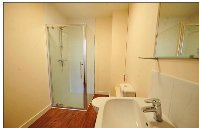
Work on the high-quality apartments is progressing well